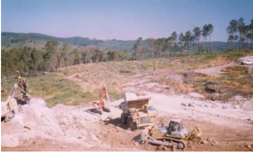
FREWAY OF THE "CONNECTION OF IP 3 TO IP 5 OF SOPOL / PAVIA" OF 13 KM, FOR INTERNATIONAL EPSA, S.A. TOPOGRAPHY: RISING OF PROFILES OF THE NATURAL LAND AND ATTENDANCE OF MONTHLY MEASUREMENTS IN THE PLACE OF VILA CHÃ DE SÁ - VISEU