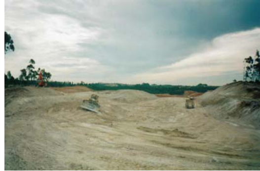
NORTH LINE – SOUTH OF THE ROAD-OF IRON, AXIS LISBON – PORTO FORSETOPO TOPOGRAPHY: RISING OF TRAVERSE PROFILES AND DETAILS FOR PROJECT AMONG EST. OF ESTARREJA CACIA - AVEIRO