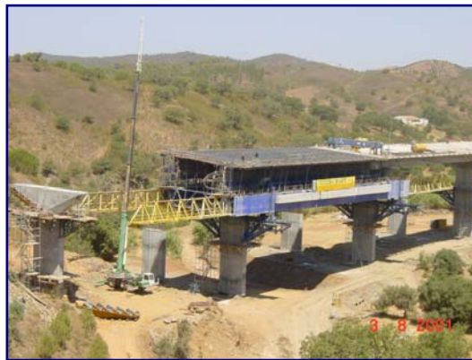
IHERA – CONSTRUCTION OF IT TAKES OF WATER, DERIVATION AND ELEVATION STATION OF RIVER TEJO, CONCHOSO FOR PARA TEIXEIRA DUARTE S.A. TOPOGRAPHY: CONTINUATION AND GENERAL ATTENDANCE IN THE PLACE OF V. F. OF XIRA