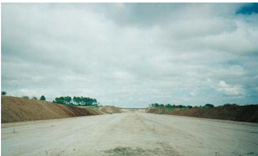
A-15 FREEWAY OF ATLANTIC OCEAN" LOT MALAQUEIJO TO RIO MAIOR OF MAIA MONIZ /