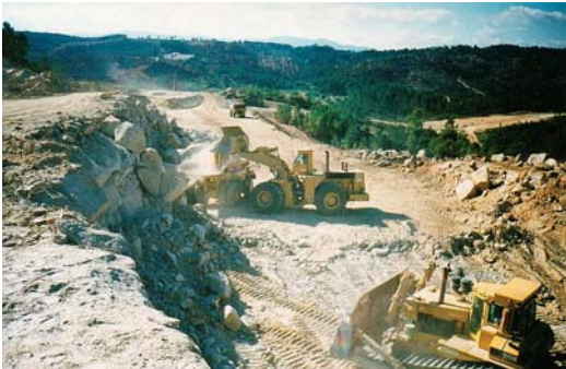
EMISSÁRIO DA QUINTA DO CONDE PARA OLIVEIRAS, SA TOPOGRAPHY: TOPOGRAPHY WORK IN PLACE OF QUINTA DO CONDE- SESIMBRA